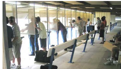
The 'Old and Bold' enjoyed their day at the Murrumba PC, with some being bolder than others!